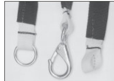
"Saddle attachment options."