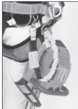
"Suspended on saddle."