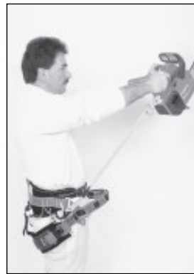
"Fully stretched and ready to cut."