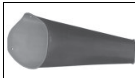
Straight Arm Two-Color