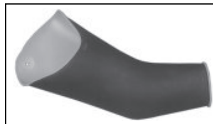
Curved Arm Two-Color