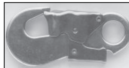
1708 Aluminum Body Locking Rope Snap Hook (Option +6) 7/8" eye (I.D.) .718" opening 5 1/4" length 5.4 oz. weight Rated to 5,600 pounds