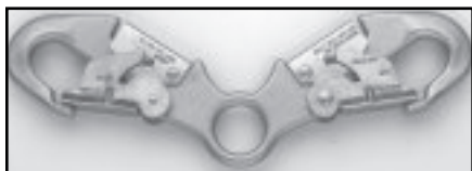
3032L Spreader Snap Hook 1" eye (I.D.) 9" long 5/8" opening Rated to 5,000 pounds