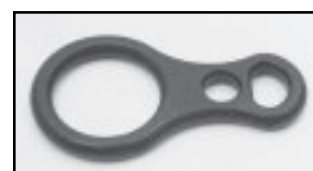
5009 Figure 8 without Ears 5009E Figure 8 with Ears

273 Weymouth Street, Rockland, MA 02370 Phone 781-871-1920 • Fax 781-878-1507 • www.hydrone.com