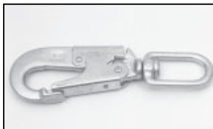
1704 (Option 8) Swivel Locking Rope Snap 1" wide eye 13/16" opening 7 1/16" long Rated to 5000 lbs.