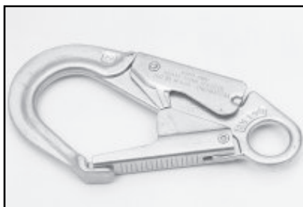
3129 Small Locking Ladder Snap (Option Z) 1" eye (I.D.) 1.750" opening 8 1/8" length 1 lb. 3 oz. weight Rated to 5,000 pounds