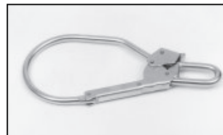
3034 (Option B) Large Locking Rebar Hook 15/16" eye (I.D.) 3 11/32" opening 13" length Rated to 3968 lbs. (Only to be used on shock absorbing style lanyards)