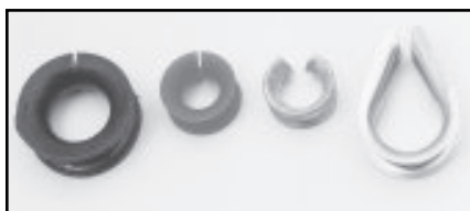
Thimbles 5/8" 350411 plastic 1/2" 350410 plastic 1/2" 350408 metal 1/2" 350409 metal