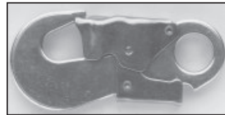
1708 Aluminum Body Locking Rope Snap Hook (Option +6) 7/8" eye (I.D.) .718" opening 5 1/4" length 5.4 oz. weight Rated to 5,600 pounds