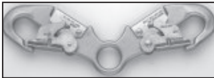
3032L Spreader Snap Hook 1" eye (I.D.) 9" long 5/8" opening Rated to 5,000 pounds