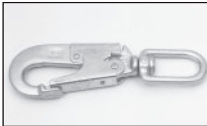
1704 (Option 8) Swivel Locking Rope Snap 1" wide eye 13/16" opening 7 1/16" long Rated to 5000 lbs.