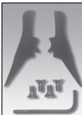
T9106A CCA gaff 16° non-contoured shank