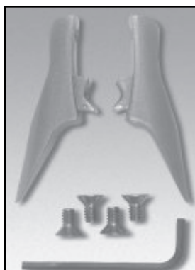
TB9206A Standard gaff 16° contoured shank