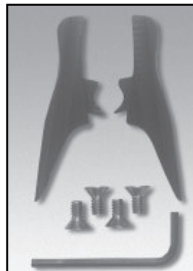
TB9106 CCA gaff 12° contoured shank