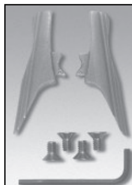
TB9106A CCA gaff 16° contoured shank

Replacement gaff kits include 1 pair of gaffs, 4 stainless steel 5/32" Allen wrench screws, Allen wrench and instructions.