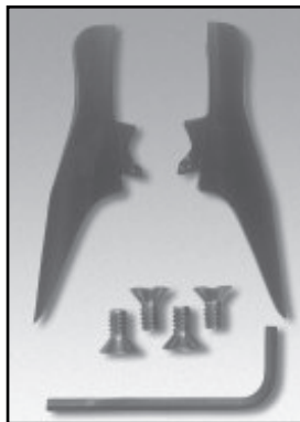
TB9206 Standard gaff 12° contoured shank