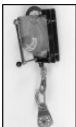
5001 Includes pulley and carabiner