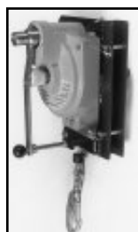
5000 Includes pulley and carabiner

Above winches come in 50, 65 or 100 ft. lengths. Please specify length desired. Winches available with spectra rope (Kevlar) lifeline by adding suffix "K" to model number.