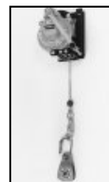
5010 Includes pulley and carabiner