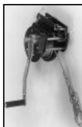
5002 Includes pulley and carabiner