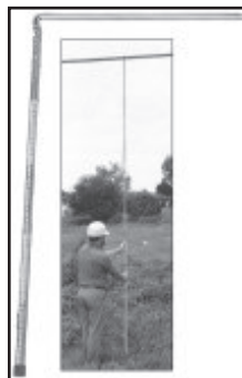
No. E-15 Wt. 2-3/4 lbs.

For measuring vertical heights of loads on transport trucks, trailers and other elevated structures. Fiber glass arm is attached to tip section of eye level measuring stick with a special aluminum casting enabling the 36" (inch) arm to be extended in a horizontal position for reaching over objects to obtain an accurate measurement of load height. Arm can be folded down for transport or storage.