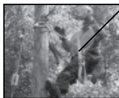
A second positioning strap, 48119Y (see page 16), can also be used to secure the user when climbing over obstacles.