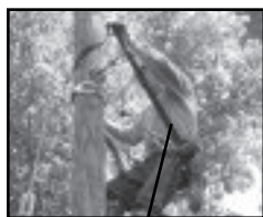
8' Retractable Lanyard, Model 5008-80F+N, mounts on the body belt & secures the user when climbing over obstacles.