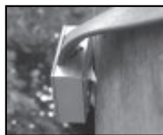
The BuckTooth, Model 485, is an accessory that must be installed when climbing iced poles.

*Brings a user into compliance with OSHA 1910.269 (g)(2)(v) requirements.