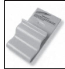
24-08R Tool Handle