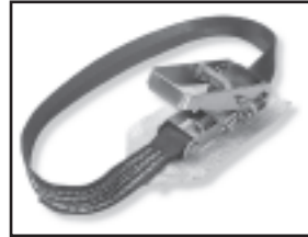
24-09R 5' Nylon Strap with Ratchet