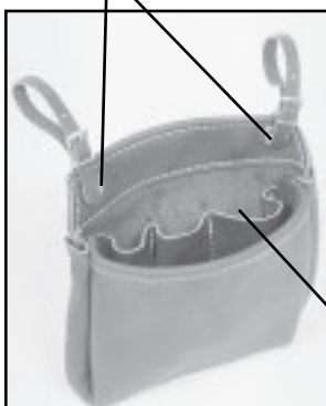
*52993 Inside Pockets