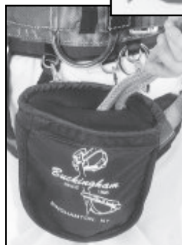
45702C4S9 - Heavy White Canvas

Nut and bolt bag with a self-closure elastic top. Prevents small parts from falling out.