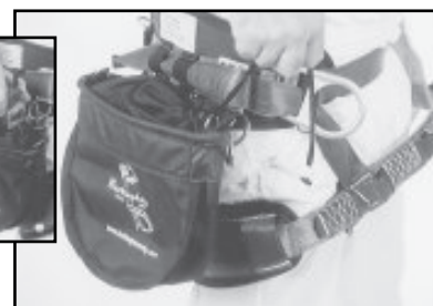
45702P1S2 - Purple Cordura