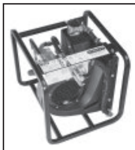
HV18 Hydraulic Converter