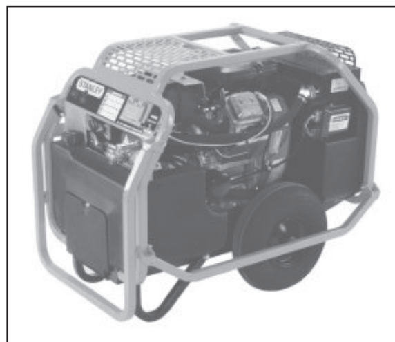
GT18 Compact Power Unit

Hydraulic power to operate Stanley's large line of hydraulic tools is available in small, compact, and efficient units as shown below like the GT18 that is about the size of a wheelbarrow. The versatility of hydraulics allows for an even wider range of uses such as the TracHorse that is a small carryall with hydraulic drive tracks, powered tilt bed, and hydraulic tool circuit. And the HV18 Hydraulic Converter lets you operate hydraulic tools from your skidsteer loader or backhoe.