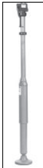
TA54 w/o Valve