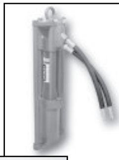
PD45 Post Driver

Make fast work of driving sign posts or ground rods with one of the Stanley driving tools shown below. Use the powerful Stanley Earth Auger for drilling fence postholes or any hole from 2 to 18 inches in diameter and 42 inches deep. Drill deeper with extensions. And when it comes to removing posts or ground rods, use the Stanley post puller that generates 9800 pounds of pulling force.