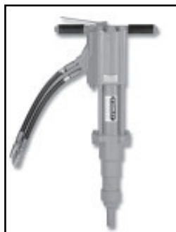
GD48 Ground Rod Driver