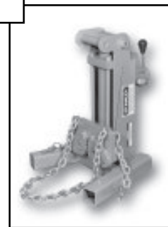
PP10 Post Puller