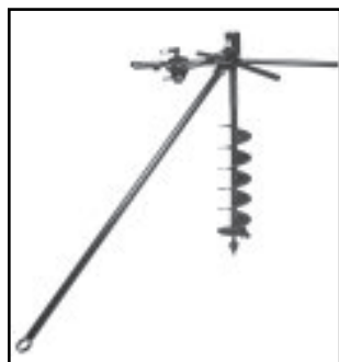
EA08 Earth Auger w/Torque Tube