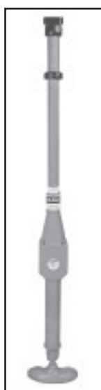
TA54 w/o Valve