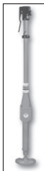
TA54 w/Valve in Handle