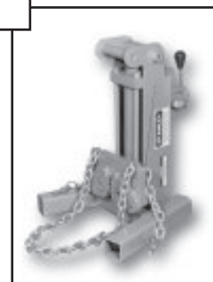
PP10 Post Puller