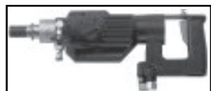
CD10 Core Drill