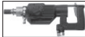
CD10 Core Drill