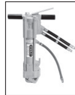
SK47 Sinker Drill

320 Libbey Industrial Parkway, Weymouth, Massachusetts 02189 Phone 781-331-5500 • Fax 781-331-5508 • www.hydrone.com