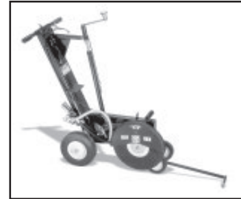
C025 w/optional Saw Cart (No. 33281)