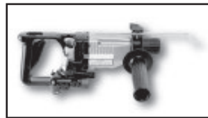
HD08 Hammer Drill