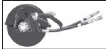
C025 Cut-off Saw